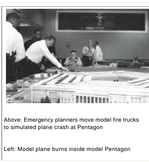
Above: Emergency planners move model fire trucks to simulated plane crash at Pentagon